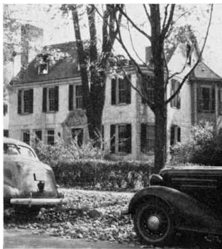
The Iktinos chapter house after the fire. The burned third floor is partly concealed by the trees.