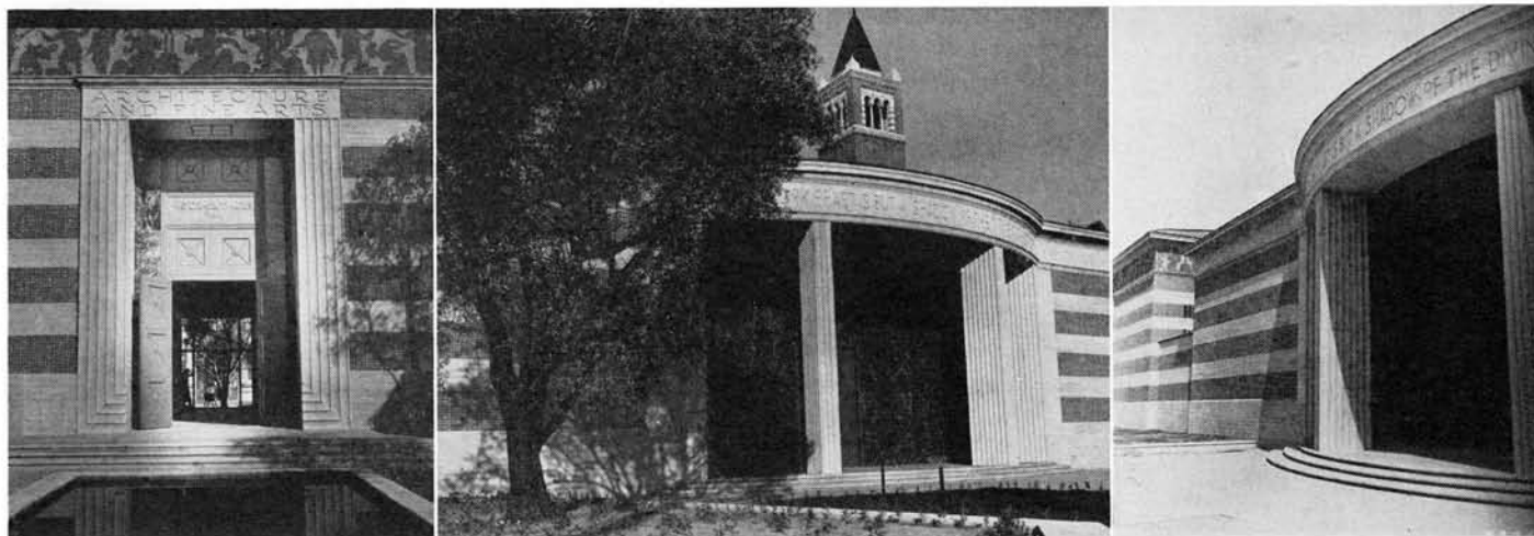
AT THE UNIVERSITY OF SOUTHERN CALIFORNIA

Left: Entrance to May Ormerod Harris Hall for the School of Architecture and Fine Arts. Center: Elizabeth Holmes Fisher art gallery with Mudd Memorial Hall tower in the rear. Right: Entrance to Elizabeth Holmes Fisher art library and the corner of the adjacent May Ormerod Harris Hall.