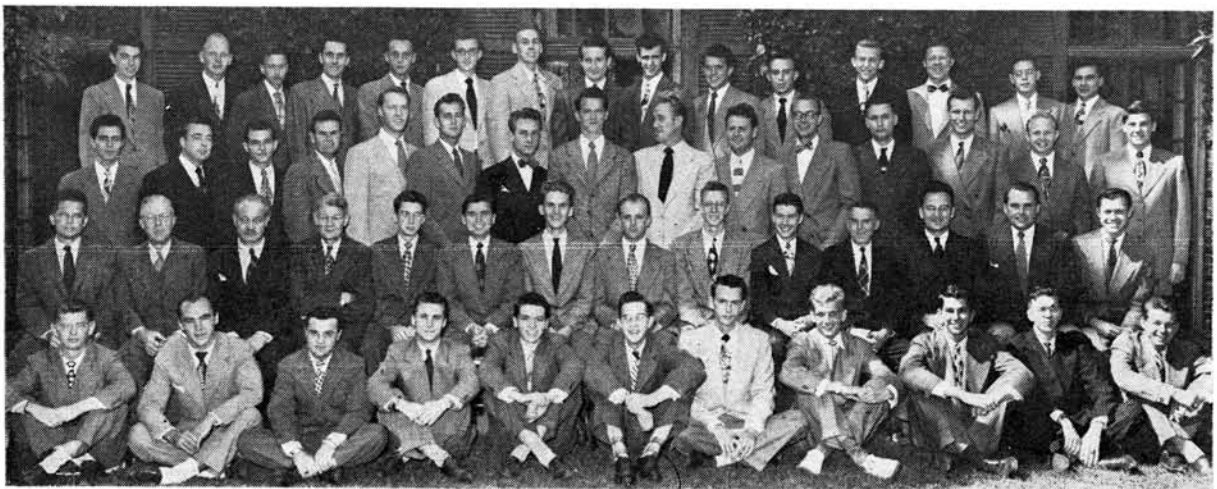
ANTHEMIOS CHAPTER AT CHAMPAIGN