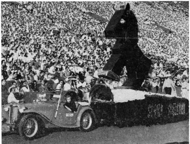
ANDRONICUS' WINNING FLOAT