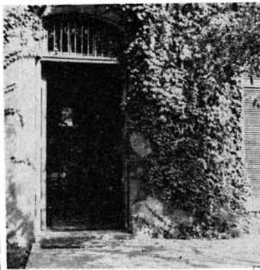
Doorway At "1108"

Anthemios pledges won second place in campus scholarship standing, with an average of 3.823, or nearly B. A new program was set up last fall with a chapter member, usually the pledge's room-