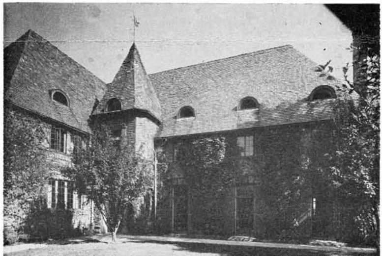
Chapter House at Champaign where 1950 Convention Met