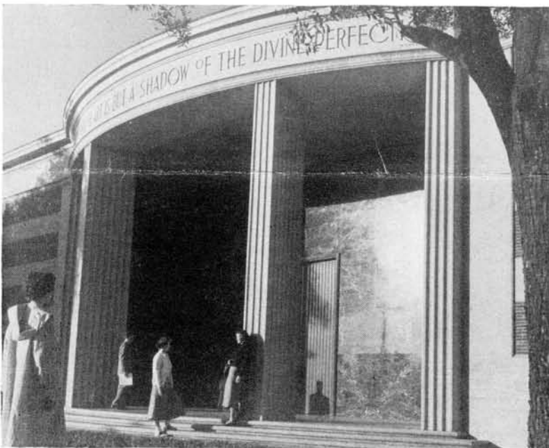
Entrance to College of Architecture, University of Southern California at Los Angeles.