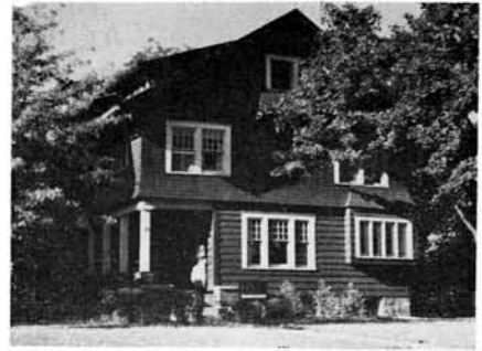
Demetrios Chapter House at Columbus where 24th National Convention will be held December 27, 28, and 29.

The Grand Council hopes to defray the cost of printing the directory by sale of at least 750 copies. The price is $1.00 to Alumni Dues Payers (Annual or Life Members) and $3.00 to others. Supply of the 1951 issue was exhausted soon after printing and it is believed the new directory will be useful to many members.