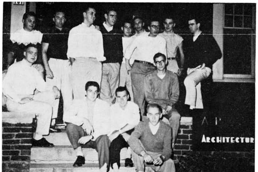
Demetrios Chapter at Ohio State University, Columbus.