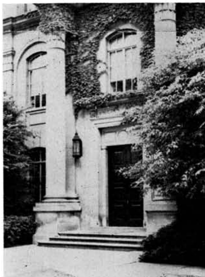
Engineering Building, The Pennsylvania State University, State College.