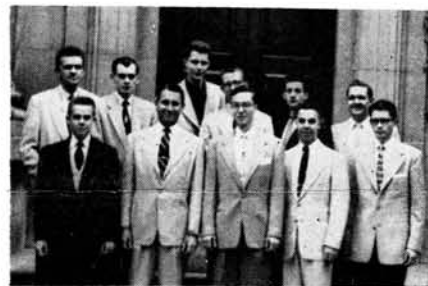
Vitruvius Architectural Society.