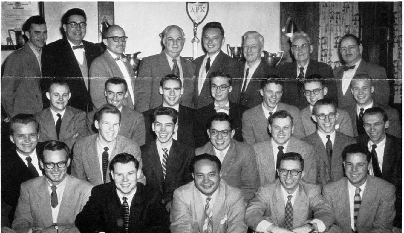
Officers and delegates who attended the 24th national convention at Ohio State which met Dec. 27, 28 and 29.