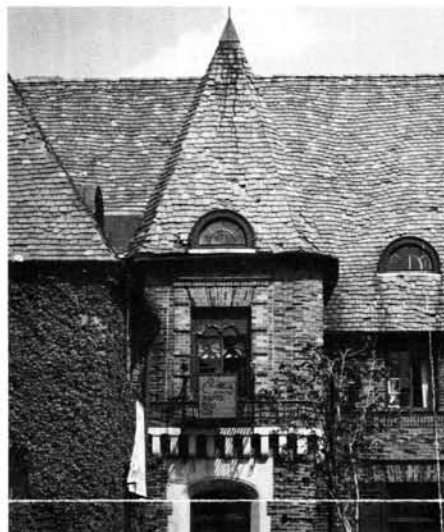
The Anthemois control Corporation has completed several phases of a major restoration program for the chapter house. Convention participants will be impressed with the results.