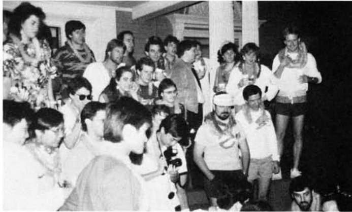
Beach Party beer chug.