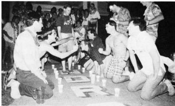
Beach Party beer chug.