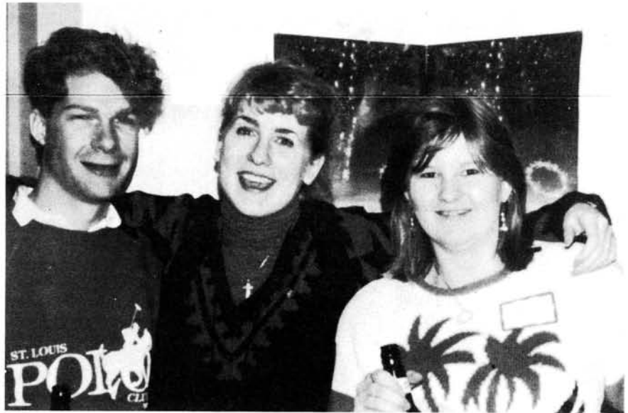
Right away we realize that we have much in common.