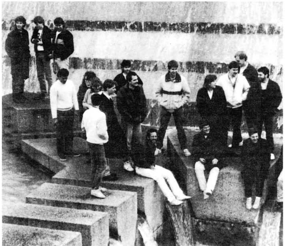
First stop on the Dallas-Fort Worth tour -- Philip Johnson's Water Gardens.