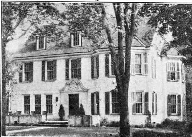
THE IKTINOS CHAPTER HOUSE