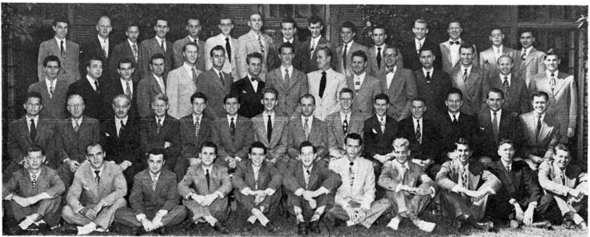
ANTHEMIOS CHAPTER AT CHAMPAIGN