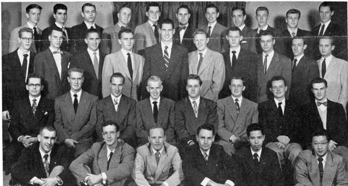
ALPHA RHO CHI AT UNIVERSITY OF MICHIGAN • Iktinos Chapter